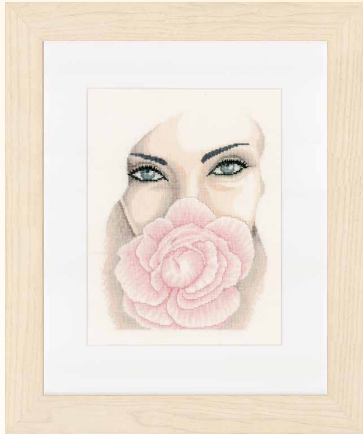
PN-0155032 B 22 x 28 cm